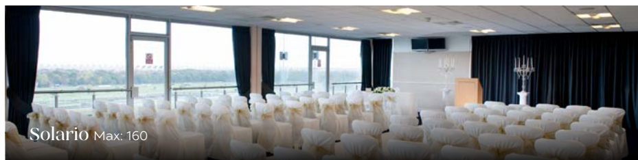
Solario Max: 160