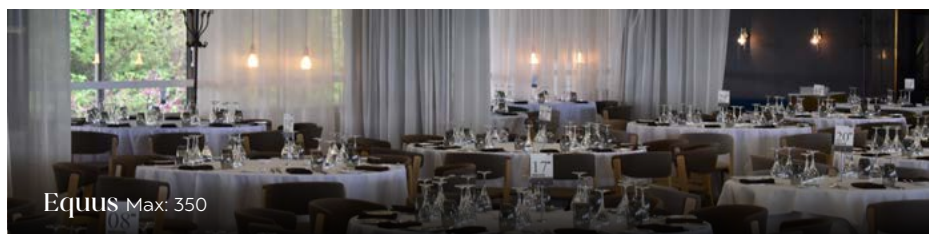
Equus Max: 350