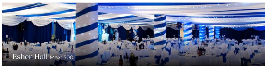
Esher Hall Max: 500